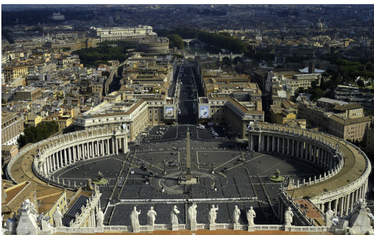
Vatican City – home of the Popes

A quotation from World History shows how the church exercised its political influence in promoting war: