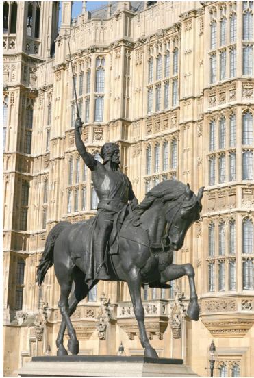
Statue of the English king Richard the Lionheart who was involved in the Crusades

The Crusades which began in 1095 are a good example of the Church becoming involved in war.