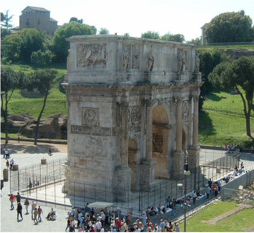
The arch of Constantine in Rome

The book World History mentions the political influences on early Christianity. It tells us about the Roman Emperor Constantine who made Christianity the official religion of the Roman Empire around AD 324: