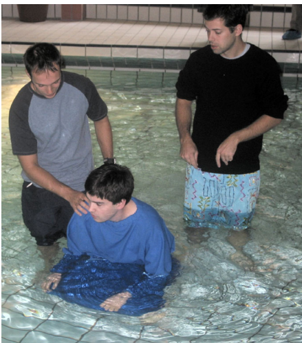
A young man about to be baptised

It is those who believe and have faith in what God has told us who will be involved in His plan. When we understand and have faith in God's plan, Paul explains what we should do to demonstrate our belief: